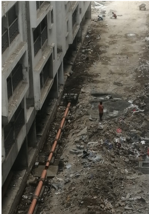
C3 – BLOCK

External Sewerage Lines : Laying of External Sewage line & construction of Chambers around C3 & B1 block on progress.