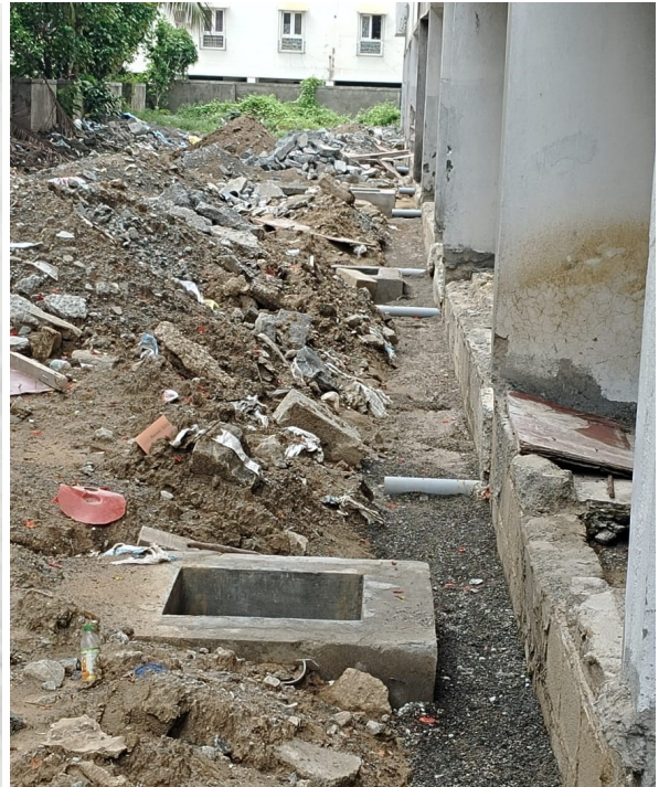
B1 - BLOCK

Storm Water Drainage: Masonry work for Strom water Drainage around D1 & C2 blocks on progress.